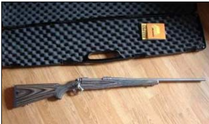
The Rifle the Detachment is raffling off. A Ruger 77 Hawkeye. 270 caliber

The Detachment is raffling off a Ruger 77 Hawkeye .270 Caliber Rifle for the 2010-2011 year. The rifle will be raffled at the 2011 Detachment Convention. Tickets will be available October 1, 2010. Let the Adjutant know how many your Squadron wants to sell as we'll not raffle it off until the gun itself is paid for.