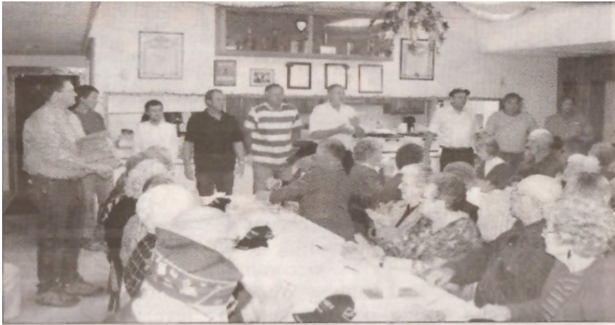
The local SAL provided the meal for the event. Here they are all give recognition for their help and donation